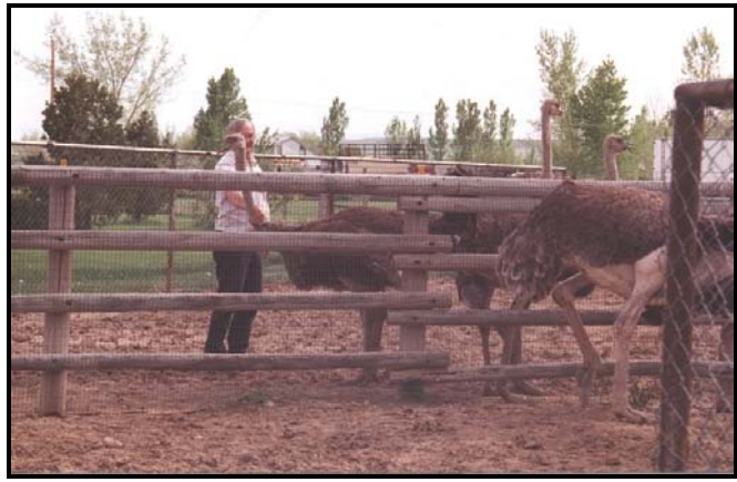
Figure 3 - Comparative Genetics

Figure 3 is a group of Breeders that have been on production rations for most of their lives. Note the contrast in size. "Maggie" is the very small bird in the photo. Her progeny never performed, even when crossed with quality genetic birds. This type of genetics needs to be identified and culled. In contrast, you can see the tremendous strength and depth of the hen in the foreground. Often I have heard farmers report their birds as being tall and therefore believe they are growing correctly. All too often these birds have developed without a good frame. It is the body depth, width and length that is important, not just the height of the birds.